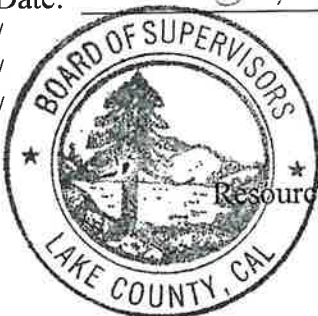
EXHIBIT A - SCOPE OF SERVICES

The within instrument is a correct copy of the document on file in this office.